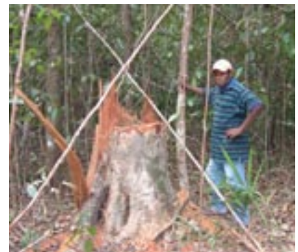
Poor tree felling