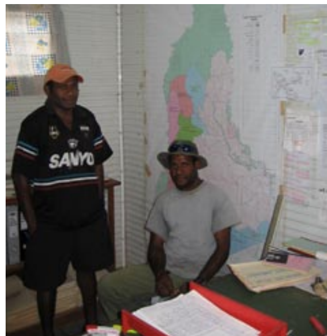
The future of the forests depends upon dedicated foresters

The different reviews set out a whole range of general governance and project specific recommendations. These range from a proposal to divide the PNG Forest Authority into two separate organizations and the implementation of a Commission of Inquiry with powers to summon documents and cross-examine witnesses, through to remedial actions to correct procedural errors in the development process for individual projects. The majority of these recommendations do not appear to have been acted upon.