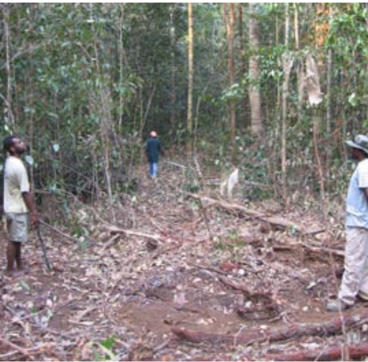
Timber harvesting need not be destructive

The first review was conducted by an independent team to evaluate the level of compliance in 32 proposed forest harvesting projects that were being developed under the requirements of the Forestry Act 1991, its supporting regulations and guidelines. As such this review very much focused on the administration of the acquisition process undertaken by the national forest service. The review team's general conclusion was that, with the exception of four notable cases, the documentation concerning all other projects showed that 'general policies, laws and proper procedures were being observed' (IFRT, 2001: iii), whilst the team noted 'although due process has generally been observed, the quality with which some of the essential steps have been dealt with has been less than acceptable' (IFRT, 2001: ii). Out of the 32 intended projects assessed, the review team recommended that four should proceed subject to some remedial action being taken, six could proceed after more significant revision, and the remaining 22 should not be taken forward.