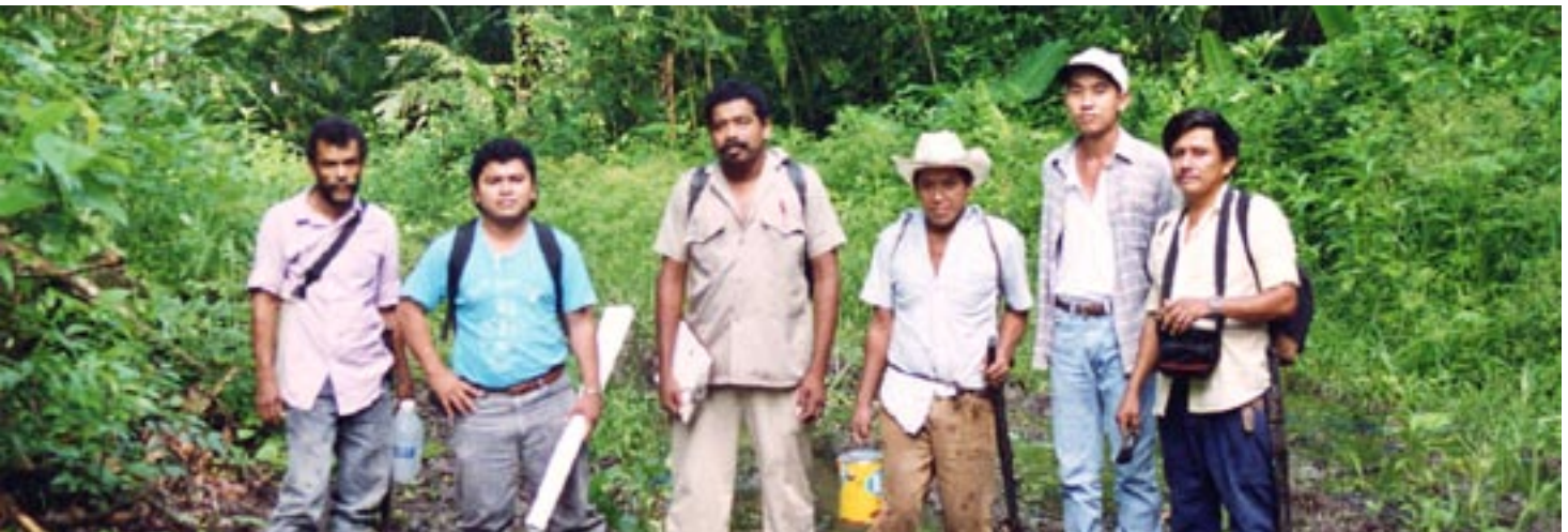
Forest management depends on well trained technicians

If sustainability is to be better guaranteed, then strategic planning needs to be strengthened. Since the 1990s, the government has invested in improving the quality of logging controls with a range of publications and guides on best practice. Yet these tend to focus on the tactical, short-term issues of planning and carrying out logging operations. There appears to be a large gap in the long-term planning that is required to ensure sustainability. Elsewhere, this planning is formulated and described in a Forest Management Plan. Landowners may be unclear of the implications of the 50-year Forest Management Agreements that they currently sign in the absence of such plans.