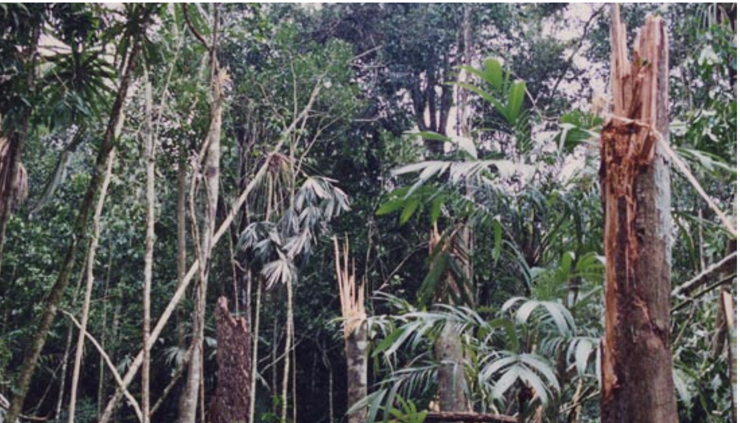
Felling damage can cause severe damage to residual trees

The picture was clearly seen as unpromising, but not uniformly so. Two exceptional projects, at Open Bay (TP15-53) and Watut West (TP13-33), were singled out for praise. They are differentiated by their long-standing nature (having been in operation for over 40 years); the commitment of the operators to a single project rather than acquiring more concessions; partial State ownership; mostly local workers and a focus on training and localisation; and a long-term commitment to establishing plantation areas to ensure continuity of supply.