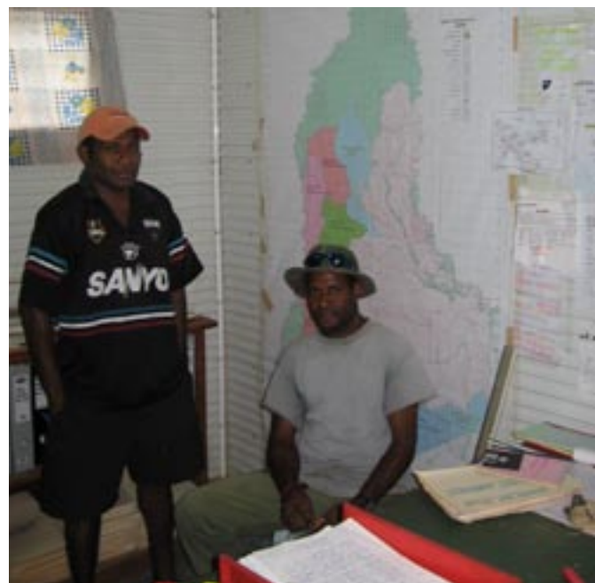
The future of the forests depends upon dedicated foresters

The different reviews set out a whole range of general governance and project specific recommendations. These range from a proposal to divide the PNG Forest Authority into two separate organizations and the implementation of a Commission of Inquiry with powers to summon documents and cross-examine witnesses, through to remedial actions to correct procedural errors in the development process for individual projects. The majority of these recommendations do not appear to have been acted upon.