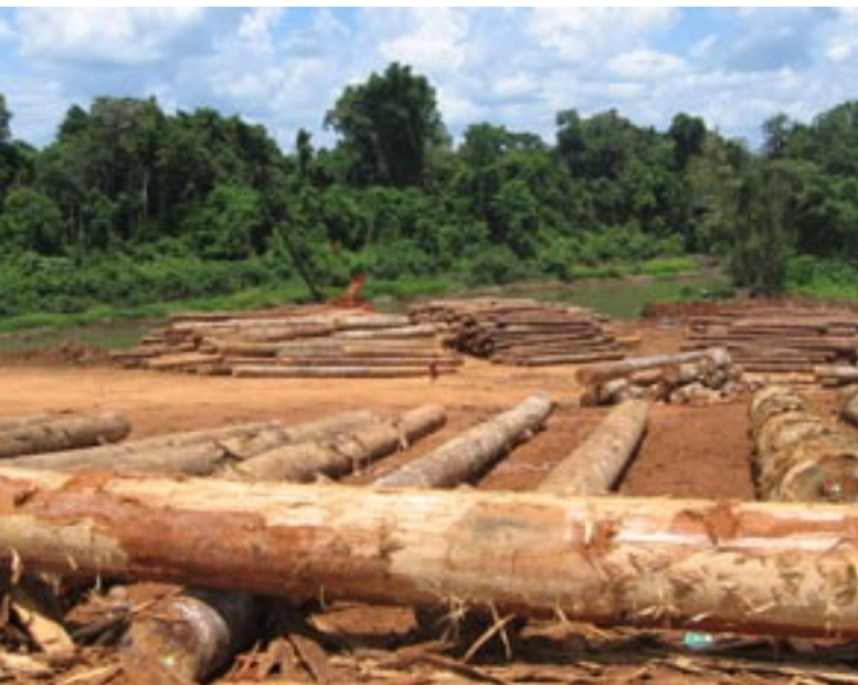
Logs waiting to be shipped for exports

The interplay between international market forces and the government regulatory regime has determined the development and structure of the forest sector over the past fifty years. PNG does not have a significant domestic market for wood due to a small population that has limited buying power. The export market is therefore the driving force in setting wood demand, and this is likely to continue. Yet, government can - and should - send signals through to the market using its policy and regulatory regime. The 1979 policy on log exports is one clear example of this.