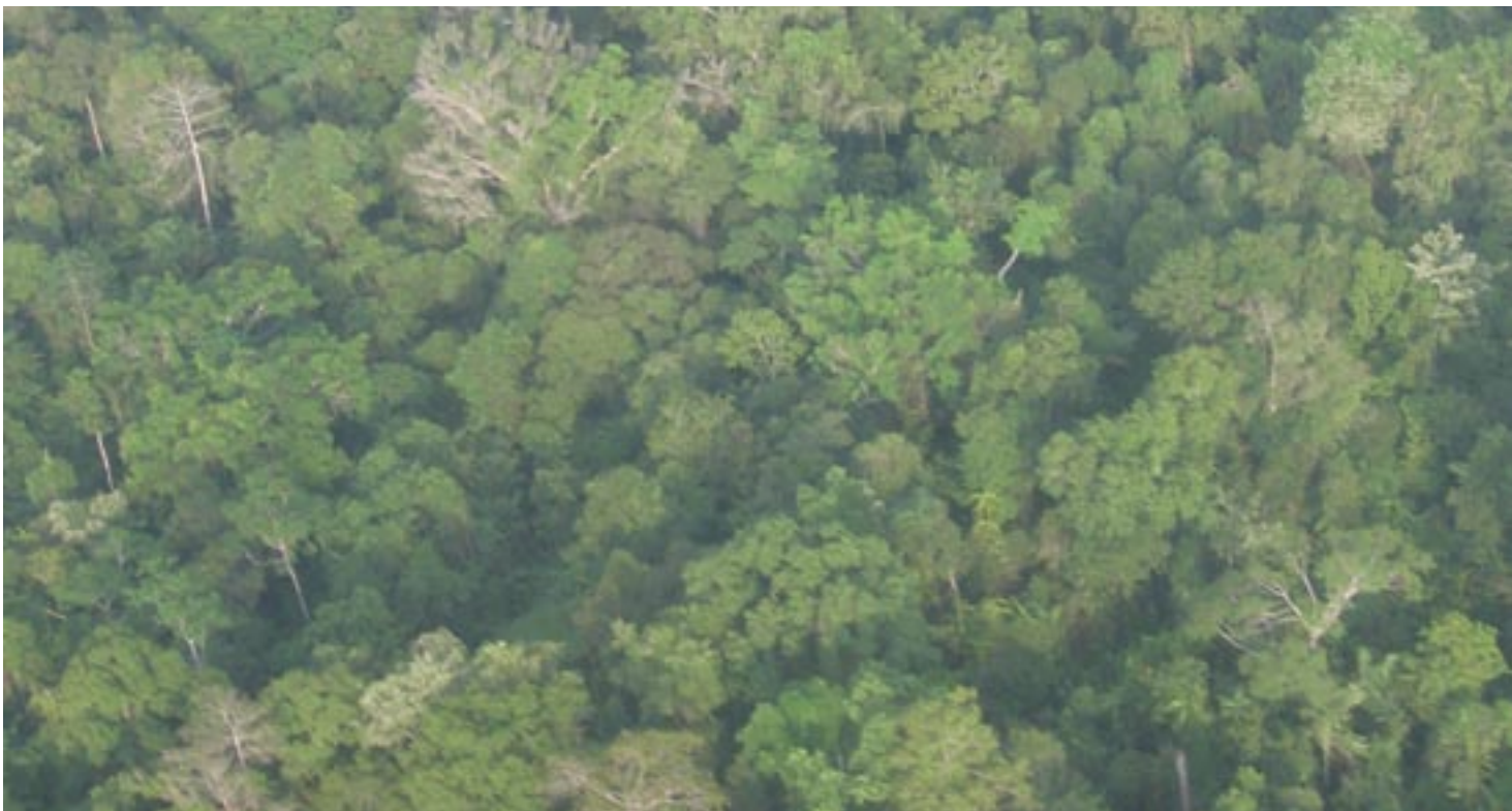
Papua New Guinea retains large expanses of tropical rainforest

“We declare our fourth goal to be for Papua New Guinea’s natural resources and environment to be conserved and used for the collective benefit of us all, and be replenished for the benefit of future generations. We accordingly call for - (1) wise use to be made of our natural resources and the environment in and on the land or seabed, in the sea, under the land, and in the air, in the interests of our development and in trust for future generations;” Section 4.