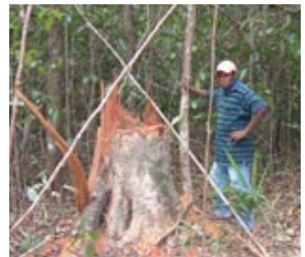
Poor tree felling