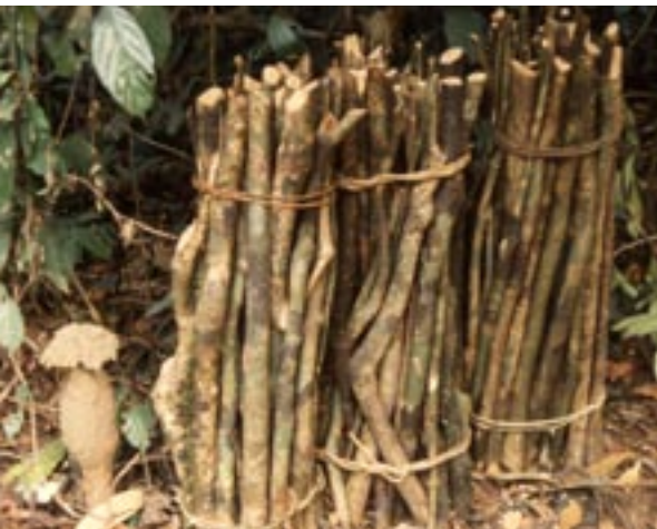
Fuelwood remains an important energy source for rural people