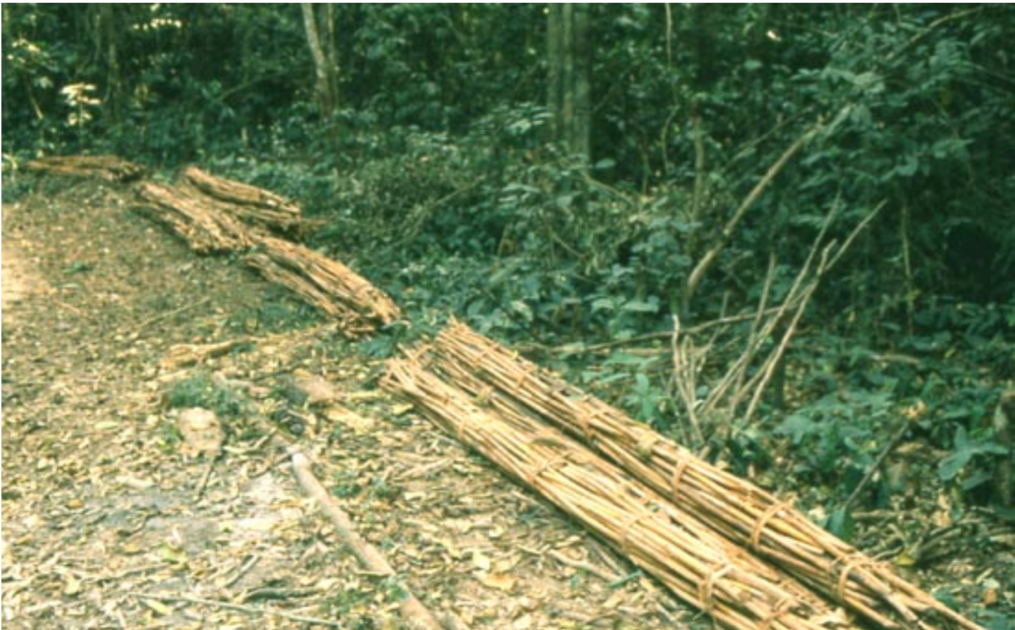
The forests provide many valuable tree products

The involvement of landowners in the forest industry does not have a good record