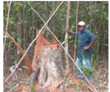
Poor tree felling