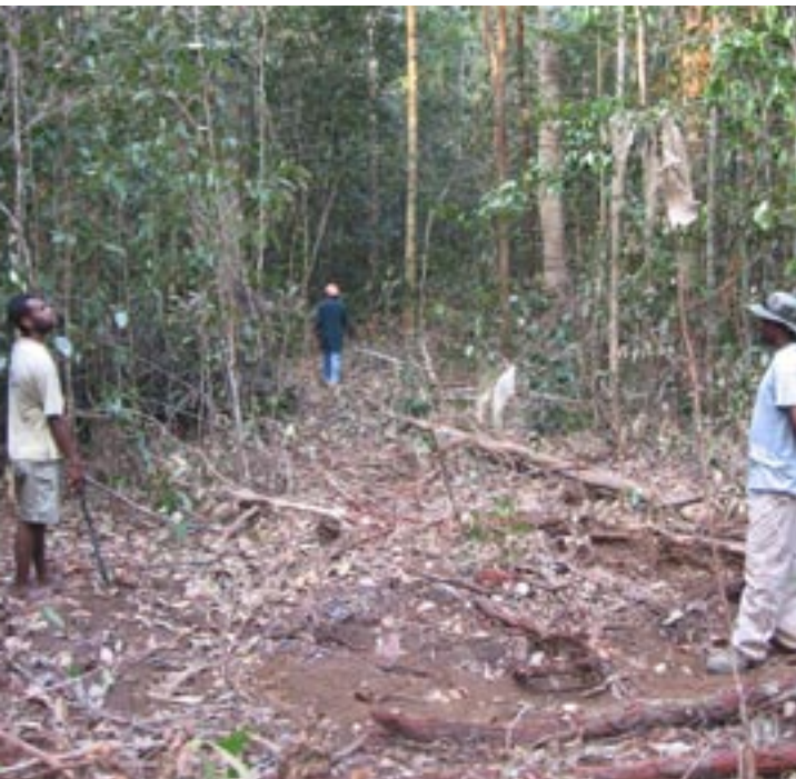
Timber harvesting need not be destructive

The first review was conducted by an independent team to evaluate the level of compliance in 32 proposed forest harvesting projects that were being developed under the requirements of the Forestry Act 1991, its supporting regulations and guidelines. As such this review very much focused on the administration of the acquisition process undertaken by the national forest service. The review team's general conclusion was that, with the exception of four notable cases, the documentation concerning all other projects showed that 'general policies, laws and proper procedures were being observed' (IFRT, 2001: iii), whilst the team noted 'although due process has generally been observed, the quality with which some of the essential steps have been dealt with has been less than acceptable' (IFRT, 2001: ii). Out of the 32 intended projects assessed, the review team recommended that four should proceed subject to some remedial action being taken, six could proceed after more significant revision, and the remaining 22 should not be taken forward.