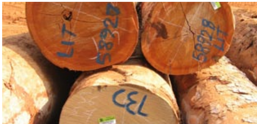
Logs that have been tagged for export

In line with the above guidelines, the standard procedure when acquiring timber areas was that landowners were paid installment payments until the area was granted to an investor and was being logged. When this occurred, the Administration recouped the amount already paid to the landowners, following which it started to pay the regular timber royalty – if there were still sufficient forest resources available to complete the process (Turia, op cit.).