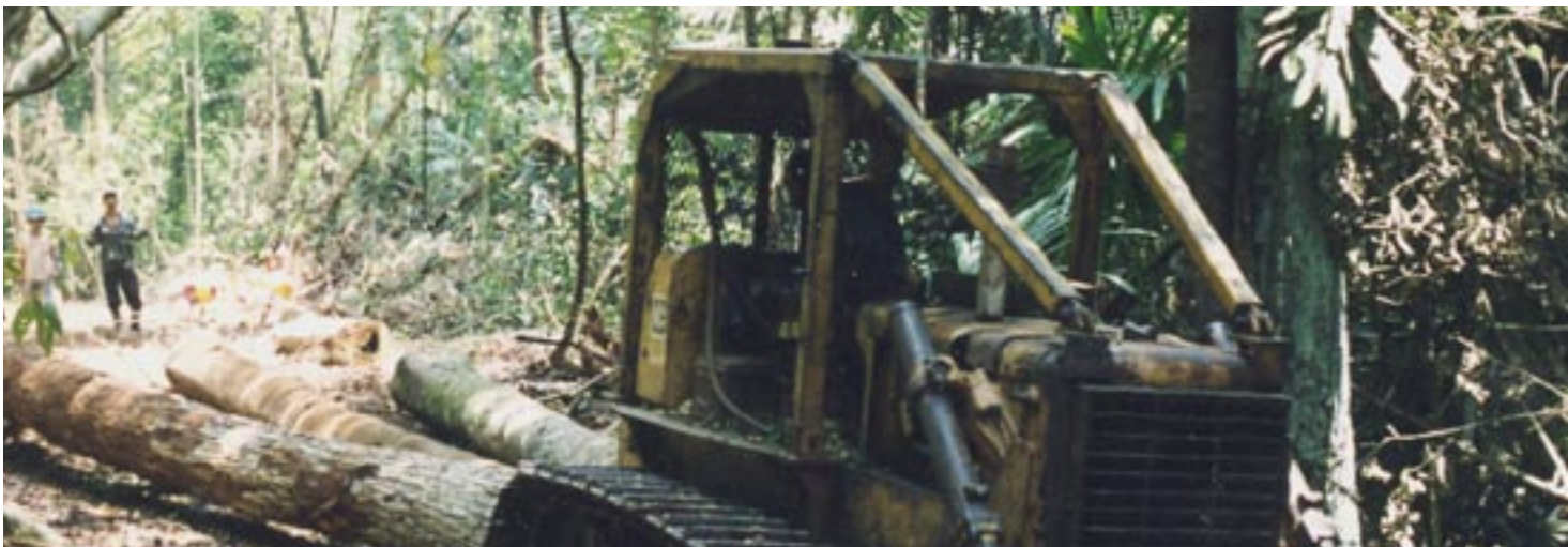
Commercial timber trees are skidded out of the forest

...some observers fear the pendulum may have swung too far in favour of the State