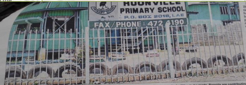
The Huonville Primary School in Lae has sent home 1869 pupils in grades 3 to 8 to allow for renovations to its facilities to be made. Parents are contributing K50 each to help build four new classrooms.